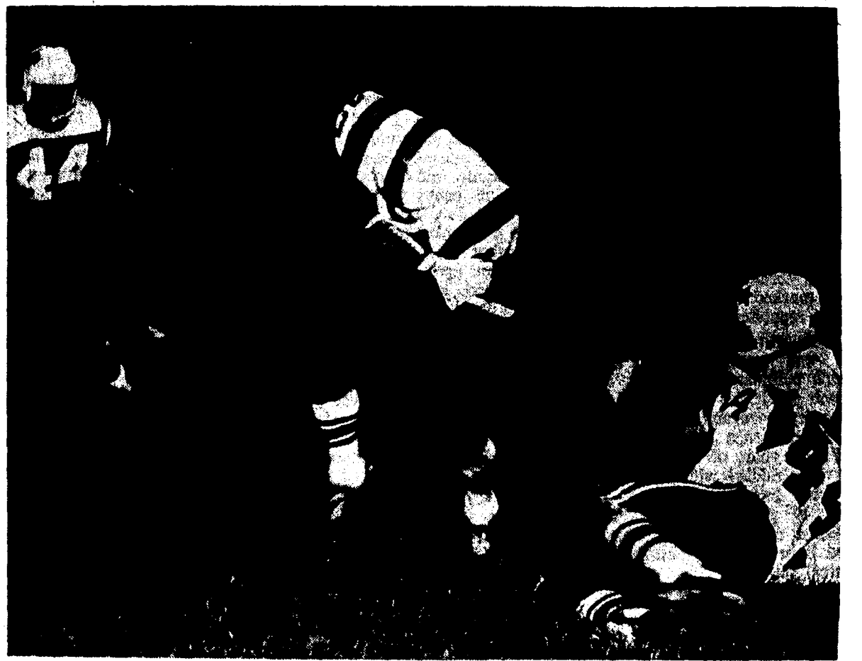
. . . good block sends Ray Young into end zone cleanly