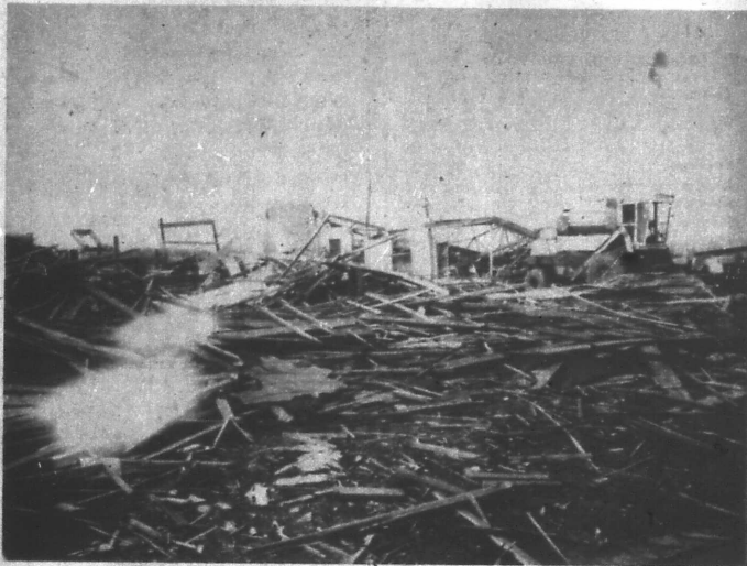
and here it went in seconds . . .