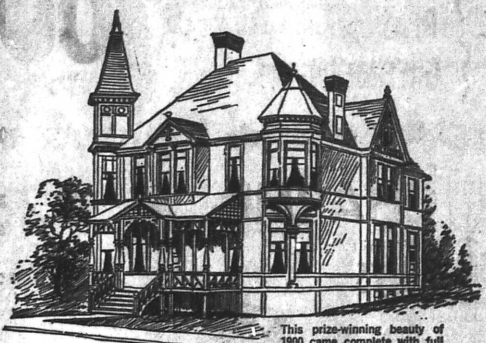
This prize-winning beauty of 1900 came complete with full basement and outdoor bath-room for $3,200.