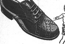
Perforated trimmed oxford. $2.75 to $3.99

A brand new collection of children's footwear combining style and sturdy wear with scientific X-Ray fit.