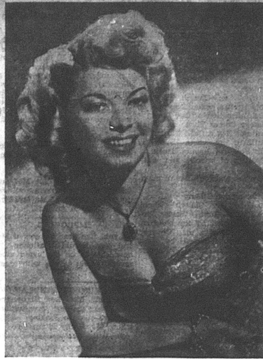
FRESH FIELD - Frances Langford, best-known to radio listeners for her song interpretations, is essaying a fresh field—as comedienne. On NBC's Sunday night Don Ameche show she portrays Elaine Blackerson in the weekly adventures of the bickering Blackersons, with Ameche and comic Danny Thomas. Not that she has given up singing, though; her songs are regular program features

Band Act - News Sunday, April 13th 13 Rue Madelene