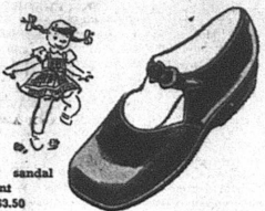
Dainty strap sandal in black patent $2.50 to $3.50