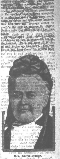
Mrs. Carrie Nation