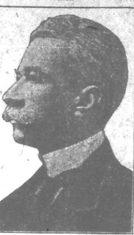
Senor da Gama, ambassador from Brazil, is one of the three South American plenipotentiaries who have offered their services as mediators between the United States and Mexico.