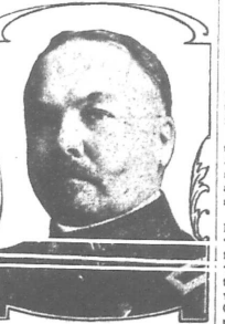
Brig. Gen. Fred Funston is in command of the Fifth Brigade, United States Infantry, now in Mexico.