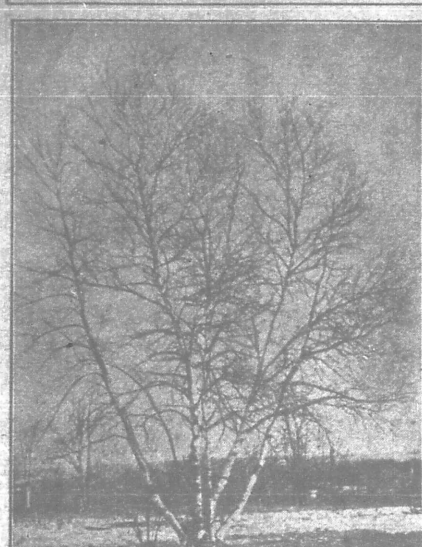
A Fine Example of the Beautiful Silver Birch—Graceful and Symmetrical.