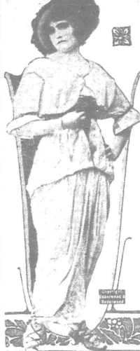
Model of champagne taffeta trimmed with black satin with lace panel in skirt. The skirt shows the tendency for extremely short styles.

GET TO WORK ON SUNSHADE None Too Early if One Would Possess Summer Accessories of Her Own Embroidering