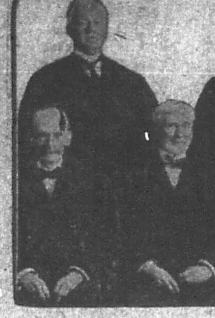
This new photograph is the only picture ever made of our highest court as it is now constituted, the last picture having been made before the death of Justice Harlan and the appointment of Justice Brandeis...