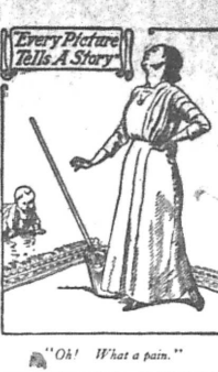
"Oh! What a pain."

The daily care of keeping house and bringing up a family are hard enough for a healthy woman. The tired, weak mother who struggles bravely to fight with a lame obliging back is carrying a heavy burden.